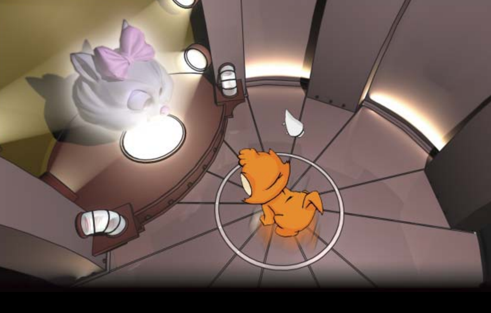
"Let's play," she typed. "I'll bring my yarn, and you bring yours. Maybe we can watch a movie. Where do you live?"